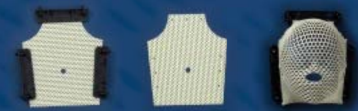
Art. No. 33690/2MA Pre-cut with profiles Art. No. 33690/2MA/NP Pre-cut without profiles

Application: Head supine Material: Efficast® Type: 3-point pediatric mask Thickness: 2 mm Perforation: maxi Packaging: 10 per box