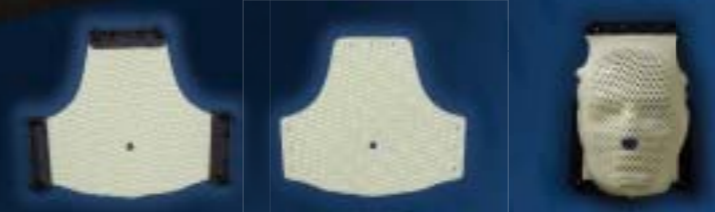
Art. No. 35773/2MA Pre-cut with profiles Art. No. 35773/2MA/NP Pre-cut without profiles

Application: Head supine Material: Efficast® Type: 2-point mask Thickness: 1.6 mm Perforation: micro Packaging: 10 per box