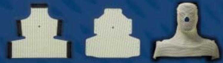
Art. No. 33770/2MA Pre-cut with profiles Art. No. 33770/2MA/NP Pre-cut without profiles

Application: Head supine Material: Efficast® Type: 3-point pediatric mask Thickness: 2 mm Perforation: maxi Packaging: 10 per box