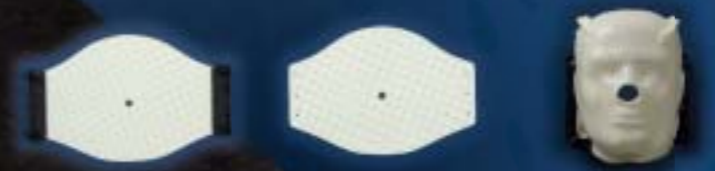
Art. No. 35772/16MI Pre-cut with profiles Art. No. 35772/16MI/NP Pre-cut without profiles

Application: Head supine Material: Efficast® Type: 2-point mask Thickness: 2 mm Perforation: maxi Packaging: 10 per box