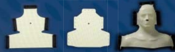
Art. No. 33770/2MI Pre-cut with profiles Art. No. 33770/2MI/NP Pre-cut without profiles

Application: Head, neck & shoulders supine - IMRT Material: Efficast® Type: 5-point mask for regular sized patients Thickness: 2 mm Perforation: maxi Packaging: 10 per box