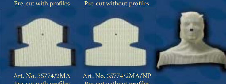
Art. No. 35774/2MA Pre-cut with profiles

Application: Head supine Material: Efficast® Type: 3-point mask Thickness: 2 mm Perforation: micro Packaging: 10 per box