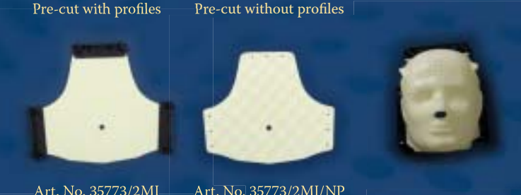
Art. No. 35773/2MI Pre-cut with profiles

Application: Head supine Material: Efficast® Type: 3-point mask Thickness: 1.6 mm Perforation: micro Packaging: 10 per box