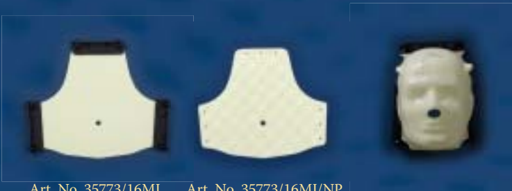
Art. No. 35773/16MI Pre-cut with profiles