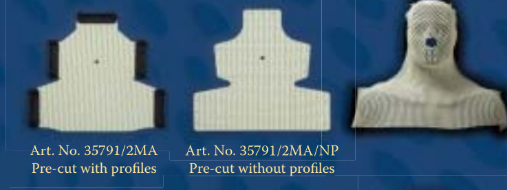
Art. No. 35791/2MA Pre-cut with profiles

Application: Head, neck & shoulders supine Material: Efficast® Type: 4-point mask Thickness: 1.6 mm Perforation: micro Packaging: 10 per box