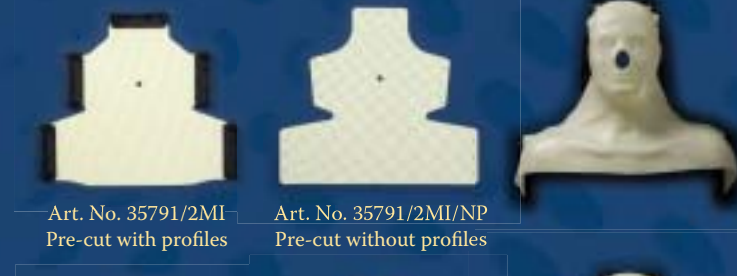
Art. No. 35791/2MI Pre-cut with profiles

Application: Head, neck & shoulders supine - IMRT Material: Efficast® Type: 5-point mask for large sized patients Thickness: 2 mm Perforation: maxi Packaging: 10 per box