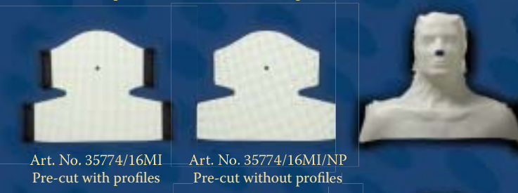
Art. No. 35774/16MI Pre-cut with profiles

Application: Head, neck & shoulders supine Material: Efficast® Type: 4-point mask Thickness: 2 mm Perforation: maxi Packaging: 10 per box