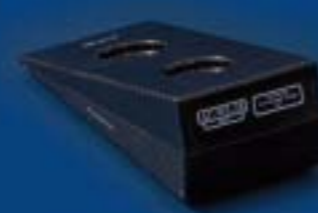
Art. No. 35707 High Precision wedge – 18° angle.

Application: flexion and extension of the head. Material: Carbon Fibre sandwich construction with Rohacel™ foam.