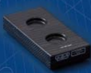
Art. No. 35706 High Precision block – 40 mm.

Application: elevation of the head. Material: Carbon Fibre sandwich construction with Rohacel™ foam.