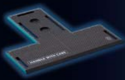
Art. No. 32110 High Precision Base plate.

Application: head, neck and shoulders fixation. Material: Carbon Fibre sandwich construction with Rohacel™ foam. Width: 54 cm.