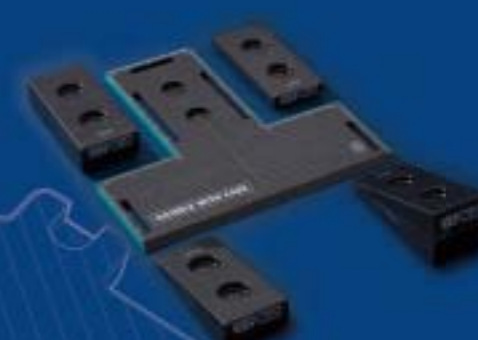
Art. No. 32110-COMBI Set of art. No. 32110, 35703, 35704, 35706, 35707.

Material: Carbon Fibre sandwich construction with Rohacel™ foam.