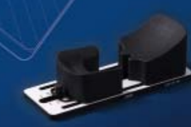
Art.No. 32380 Prone Head Support (adjustable). Application: prone position of the head.

Material: Carbon Fibre sandwich construction with Rohacel™ foam.