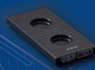
Art. No. 35703 High Precision block – 20 mm.

Application: head only when used with 40 mm block and 18° wedge. Material: Carbon Fibre sandwich construction with Rohacel™ foam. Width: 19.9 cm.