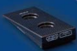
Art. No. 35704 High Precision wedge – 9° angle.

Application: elevation of the head. Material: Carbon Fibre sandwich construction with Rohacel™ foam.