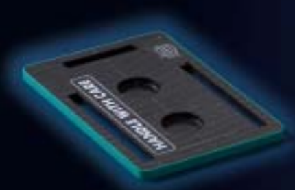
Art. No. 32130 High Precision Small Base Plate for IMRT.

Application: head and Neck. Material: Carbon Fiber sandwich construction with Rohacell® foam. Width: 34 cm