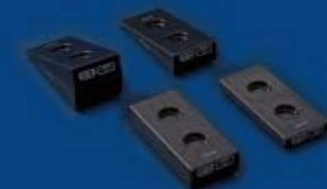
Art. No. 32700 Set of art. No. 35703, 35704, 35706, 35707.

Application: flexion and extension of the head. Material: Carbon Fibre sandwich construction with Rohacel™ foam.