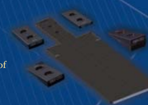
Art. No. 32150-COMBI Set of art. No. 32150, 35703, 35704, 35706, 35707.

Material: Carbon Fibre sandwich construction with Rohacel™ foam.