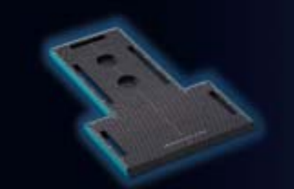
Art. No. 32111 High Precision Pediatric Base Plate.

Application: head, neck and shoulders. Material: Carbon Fibre sandwich construction with Rohacel™ foam. Width: 54 cm.