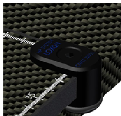
LOXON™ fixed part

The two parts of LOXON™ are mounted on the Orfit Industries base plate with the M6 x 12 screws supplied in the package. Always mount the fixation devices on the base plate before installing the base plate on the couch.