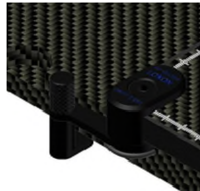
LOXON™ moving part