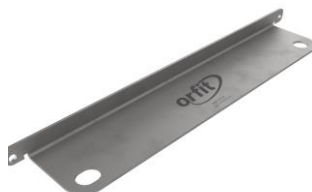
Article No. : 35747/4