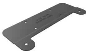
Article No. : 35747