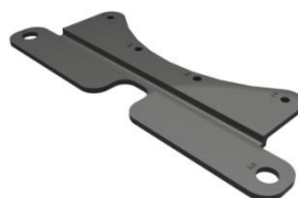
Article No. : 32063