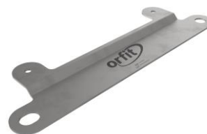
Article No. : 35747/6