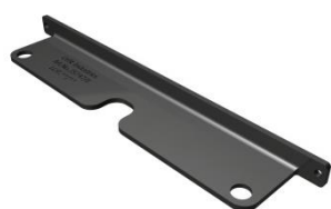
Article No. : 35747/8