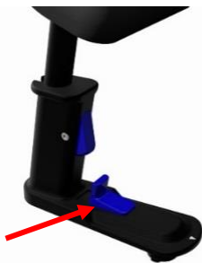
Figure 3: Bottom trigger of Adjustable Arm Support

To mount the Adjustable Arm Support on the SBRT Base Plate or MammoRx Breast Board, pull the bottom blue trigger (see Figure 3) and insert the post with its two tabs into the desired hole. The arrow on the base plate should be pointing towards the line on the support. Then rotate it downwards to the desired position. The Adjustable Arm Supports can be rotated to one of four indexed positions that are marked R1-R4, L1-L4, RA-RD, LA-LD. To remove the support, pull the blue trigger and rotate the Adjustable Arm Support past the R4, RD, L4 or LD position until it stops at the arrow and lift it out of the mounting hole.