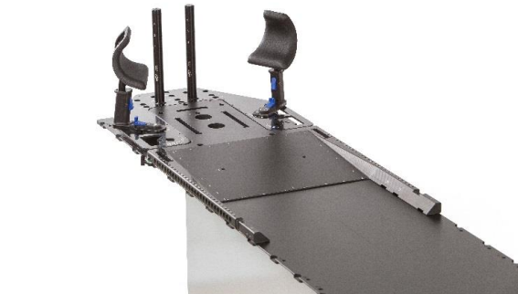
Figure 1: Adjustable Arm Supports and Hand Grips on Short SBRT Base Plate

The Adjustable Arm Supports and Hand Grips can also be indexed on the MammoRx® Breast Board (Figure 2).