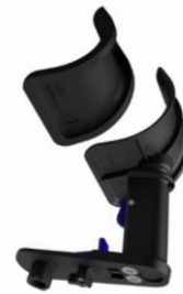
Figure 6: Removable cushion of Adjustable Arm Support

Take off the cushion to have access to the entire arm pad, and to be able to clean the cushion on the inside.