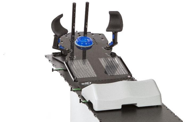
Figure 2: Adjustable Arm Supports and Hand Grips on MammoRx® Breast Board

The Adjustable Arm Supports and Hand Grips can also be indexed on the MammoRx® Breast Board (Figure 2).